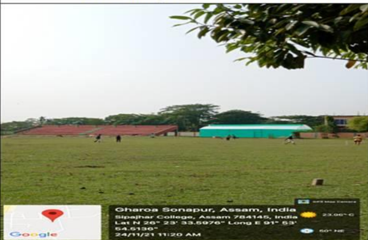
Green (grass) and tree coverage of college playground