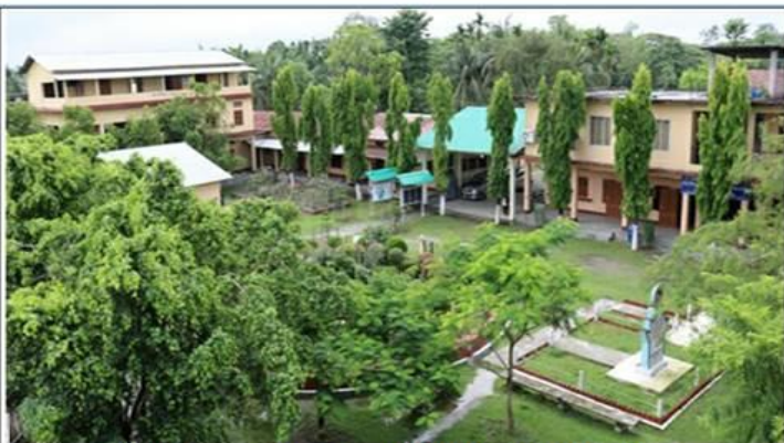
Aerial view of natural beauty of the college

Code of Conduct It is mandatory for the students to come to the college in the prescribed uniform and to carry identity cards at all times. Indulging in ragging in any form inside and outside the college is strictly prohibited. Any student found doing so will be dealt with as per directives of the Courts. Students are strictly prohibited from damaging college property. The cost of any such damage will be recovered from the student/guardian. The college campus is a No Smoking, No Tobacco, No Plastic, No Alcohol, No Drugs zone. The use of Mobile Phones inside the college campus is strictly prohibited and phones (handsets) used inside the college will be confiscated. All students should read the notice board regularly. Minimum attendance of 75% is mandatory for appearing in the Council and University examinations. Students remaining absent for more than 10 days at a stretch will have names taken off the attendance registers. To get their names re-entered in the registers, an application addressed to the HOD countersigned by the guardian and supported by a medical certificate will be considered. Poor attendance will also invite fines as fixed by the authorities.