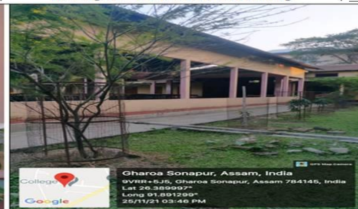
New plantation and protection