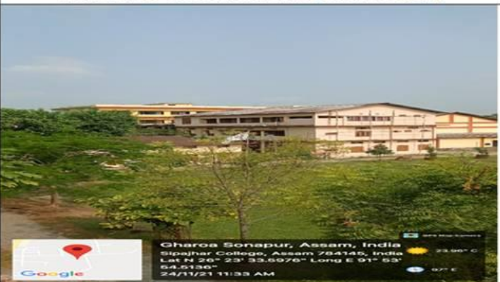
Tree coverage near guest house