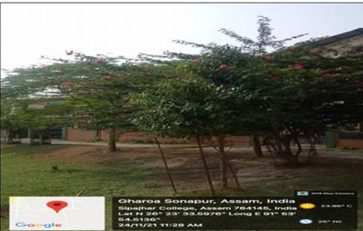
Tree Coverage in front of women's hostel