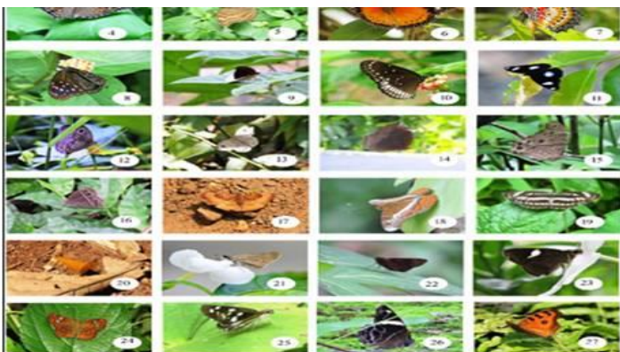
Butterfly and other fauna species identified in the campus by students under the supervision of expert teacher assigned

( http://sipajharcollege.ac.in/upload/dept_activities/1644408001.pdf )