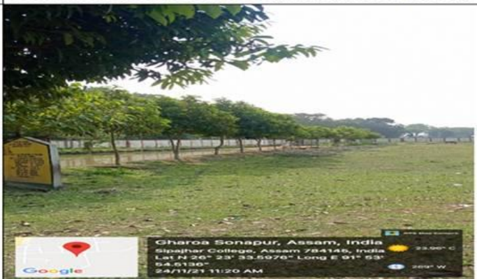
Tree coverage in the eastern part of playground