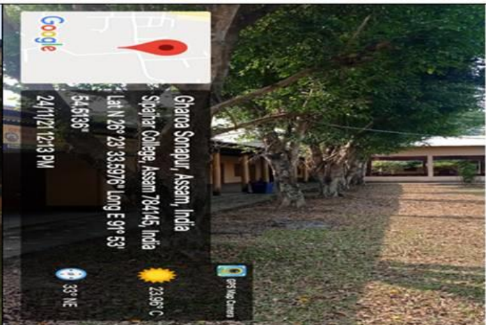
Tree coverage in front of arts building