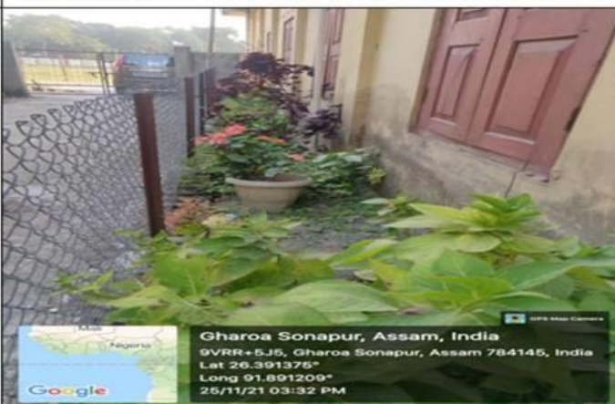
Flower garden in front of science building