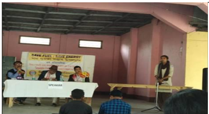
Fuel Free Day observed to reduce fossil fuel and to convey the message of sustainability to the mass