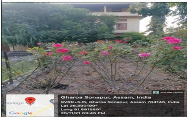
Rose garden in front of HS classrooms