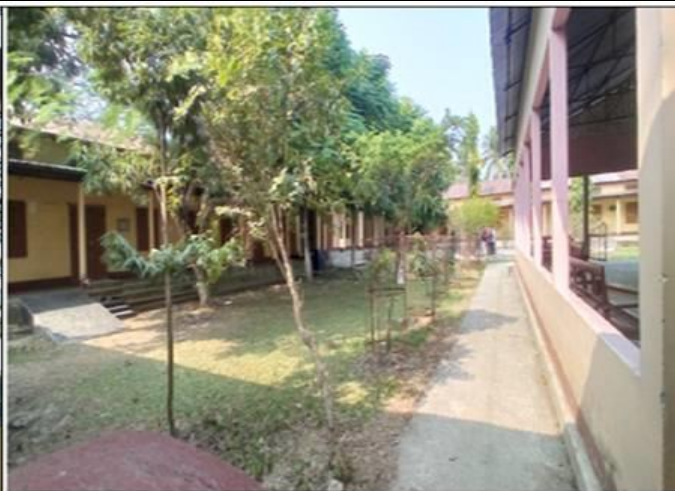
New plantation and protection in front of arts building