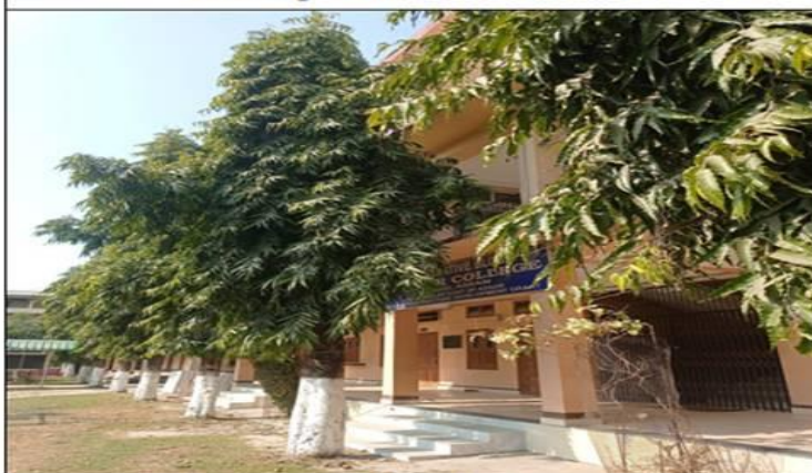
Tree Coverage in from of administrative building