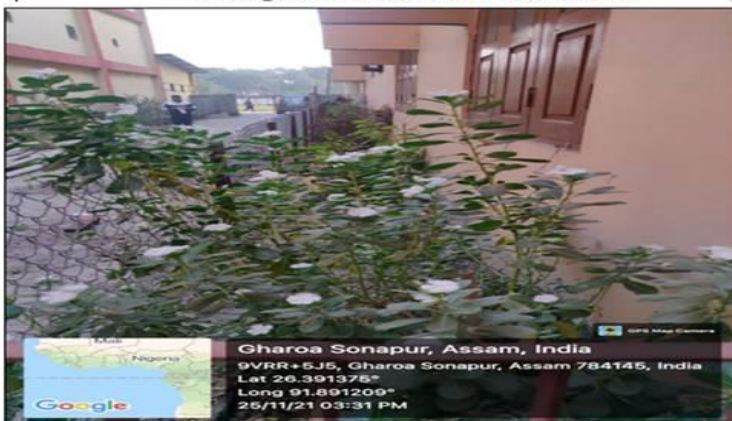
Flower garden in front of indoor stadium