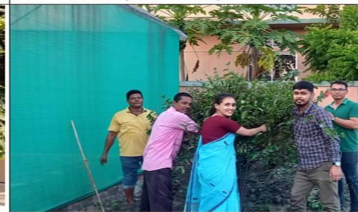
Green practices of college employees