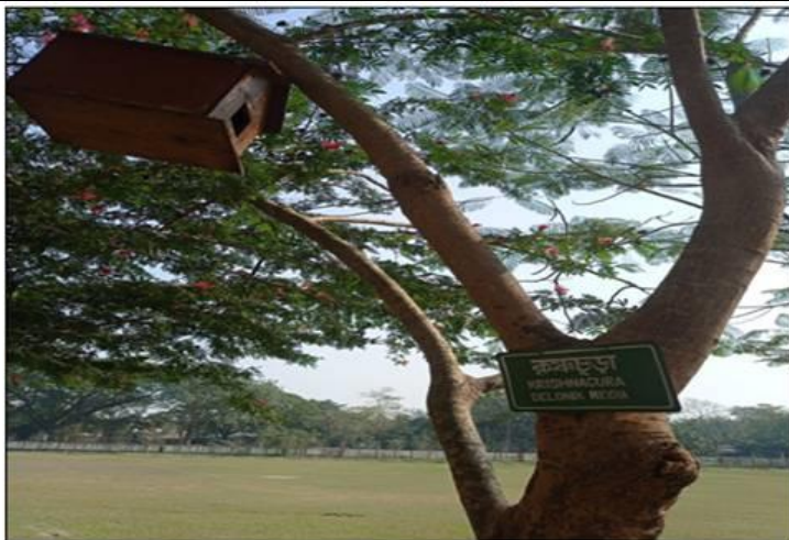
Name plate on plants