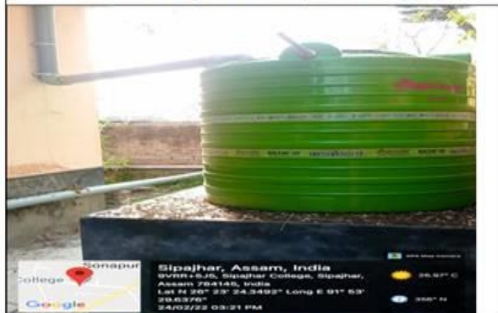
Rain Water harvesting Unit (I) inside guest house campus