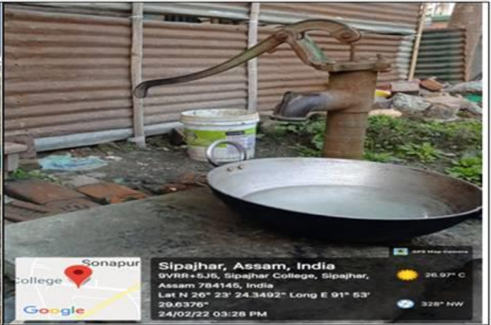
One of the tube well as water resource