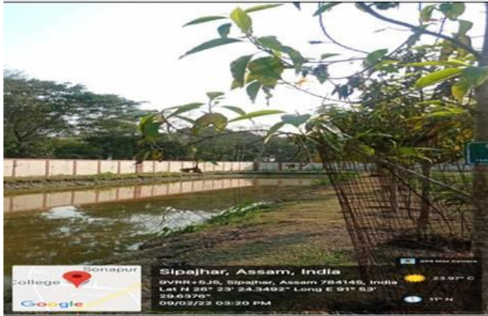
One of the water body near the playground