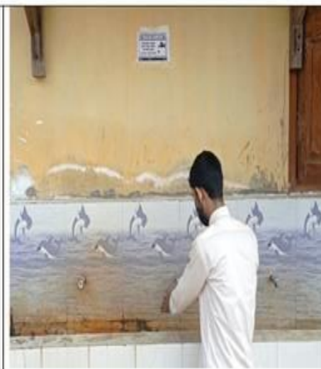
Display in all water collection points on turn off water tap after use