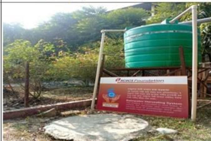
Unit (II) with ground water recharge provision