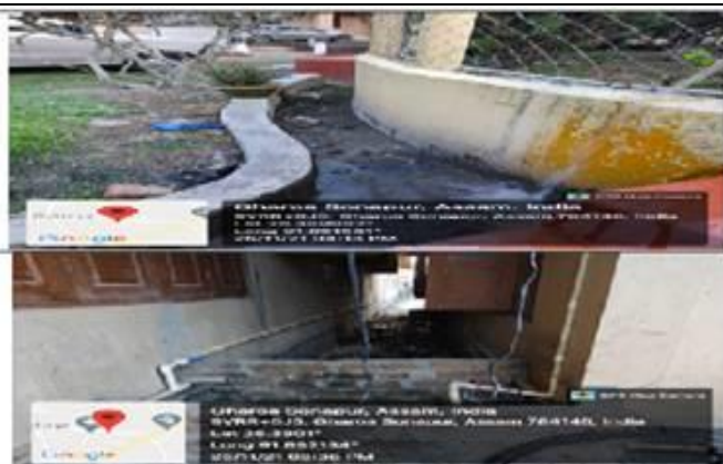
Drainage system under renovation