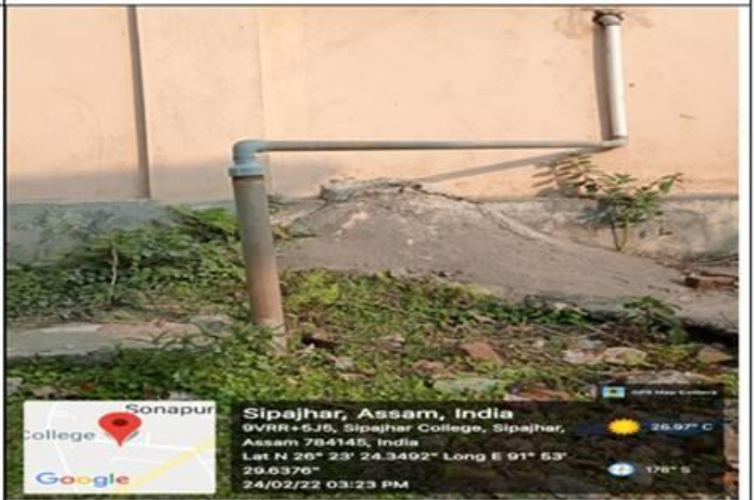
Bore drilling water well Near Library