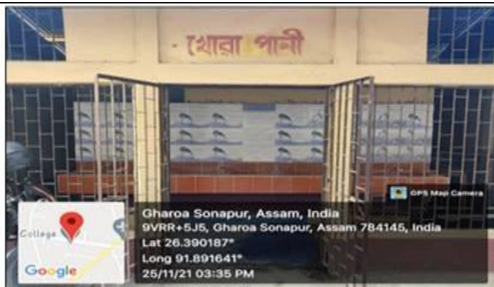
Public Drinking water facility inside campus