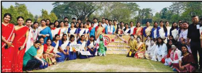
3 rd in Cultural Rally: Dept of English