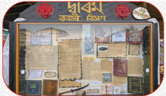
2nd Position: Dept. of History