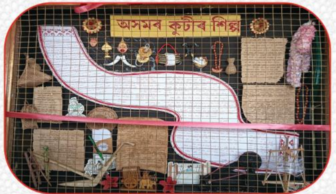
3rd Position: Dept. of Political Science