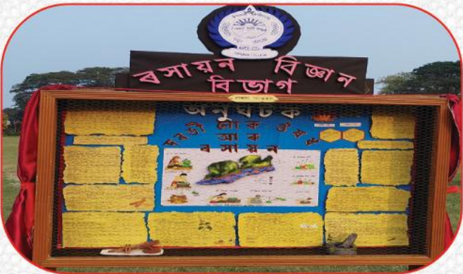
3rd Position: Dept. of Chemistry