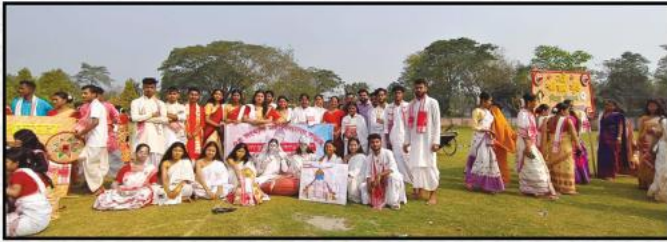
3 rd in Cultural Rally: Dept of Economics