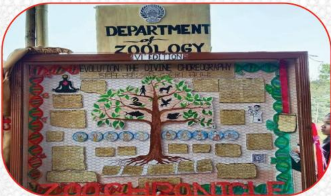
1st Position: Dept. of Zoology