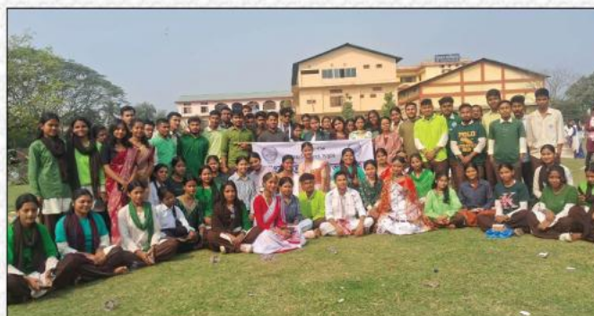
2 nd in Cultural Rally: Dept of Political Science