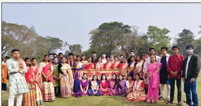
1 st in Cultural Rally: Dept. of Botany